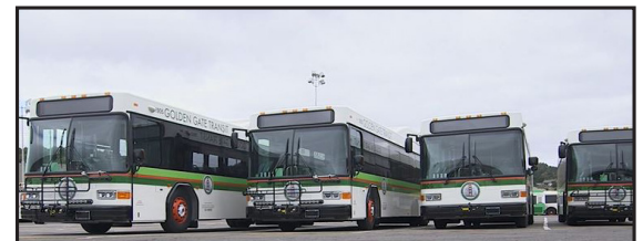
Golden Gate Transit's Hybrid Buses.

We recently added 67 new hybrid buses to the Golden Gate Transit (GGT) fleet, and we're