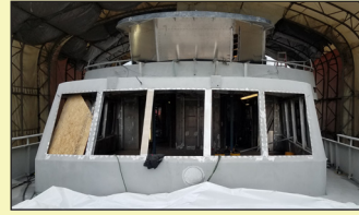
The new pilot house, above the observation lounge.

The M.S. Sonoma rebuild is nearing the end of the structural modification phase and is expected to be back in service sometime this summer.