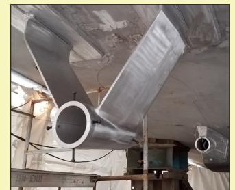
The strut and stern tube were custom made for the M.S. Sonoma.