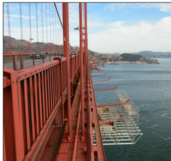
Support arms extending from the side of the Bridge will hold the stainless steel net.

While the contractor has not provided a firm final date for project delivery, the District estimates the project is likely about two years behind schedule. Completion was originally scheduled for January 2021, but that date has been pushed back to 2023.