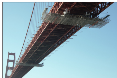
Temporary access platforms beneath the Bridge enable workers to mount the struts.